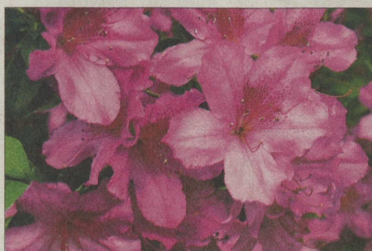
Signs of Spring are everywhere in Eagle Lake.

For more information contact the county tax office at 979-732-2710.